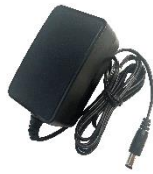
MSA-C1500IC12.0-18P-US MSA-C1500IC12.0-18P-GB MSA-C1500IC12.0-18P-JP Power adapter