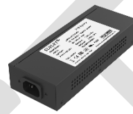
LAS60-57CN-RJ45 Hi-PoE midspan